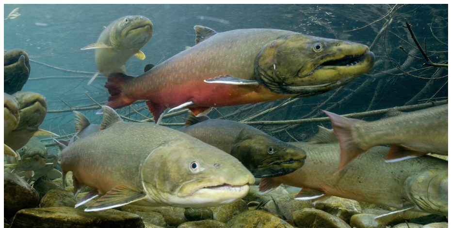
Many trout species, such as these native bull trout, are endangered.

Reversing these declines will require progressive conservation efforts to protect native trout diversity and ameliorate ongoing and future threats at local and global scales. To preserve these unique fishes, we must protect ecological and genetic diversity, which are critical for long-term resiliency, viability, and adaptation in the face of rapid environmental change. Innovative conservation approaches include reconnecting rivers with floodplains, establishing native fish refuges, restoring habitat diversity, and reducing invasive species, including non-native trout stocking programs. Moreover, comprehensive, coordinated, and comparable approaches are needed immediately to assess conservation status and to delineate conservation units across the globe, particularly for data-poor species. Only by