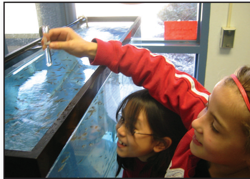
. . . study and care for them all year . . .

Many different TIC programs already take place throughout the country, from California and the Pacific Northwest to New England and Mid-Atlantic states.