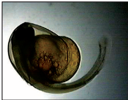
Student raise trout from eggs . . .

Trout are indicator species; their abundance directly reflects the quality of the water in which they live. In the TIC program, students grow to care about their trout and then the habitat in which trout live. As the program progresses, students learn to see connections between the trout, water resources, the environment, and themselves.